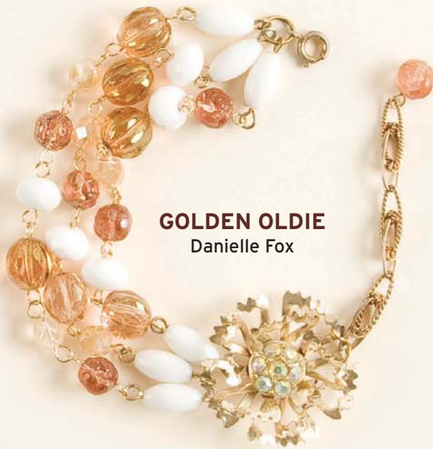
GOLDEN OLDIE Danielle Fox

Here's my collection of goodies, all bought at local flea markets for cheap, cheap, cheap!