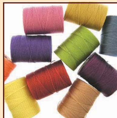
C•LON $3.50 EACH OR 10 FOR $30