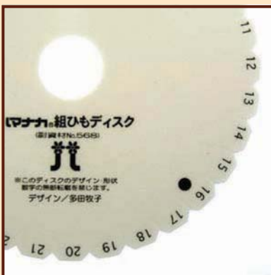
KUMIHIMO DISKS $12 KITS $20